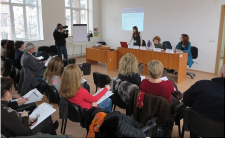
Regional Consultative Fora - 6 March 2014, Kyustendil

programming document for cross-border cooperation for the period 2014 –2020 on 4 June 2014 in Strumica was held the second round of the Regional Consultative Fora attended by over 60 representatives of both countries.